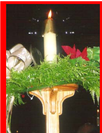
CHRIST OUR LIGHT