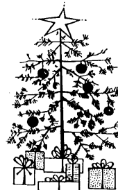
The Giving Tree

Today, December 14 th after the noon Mass, the traditional “moving of the gifts” will take place.